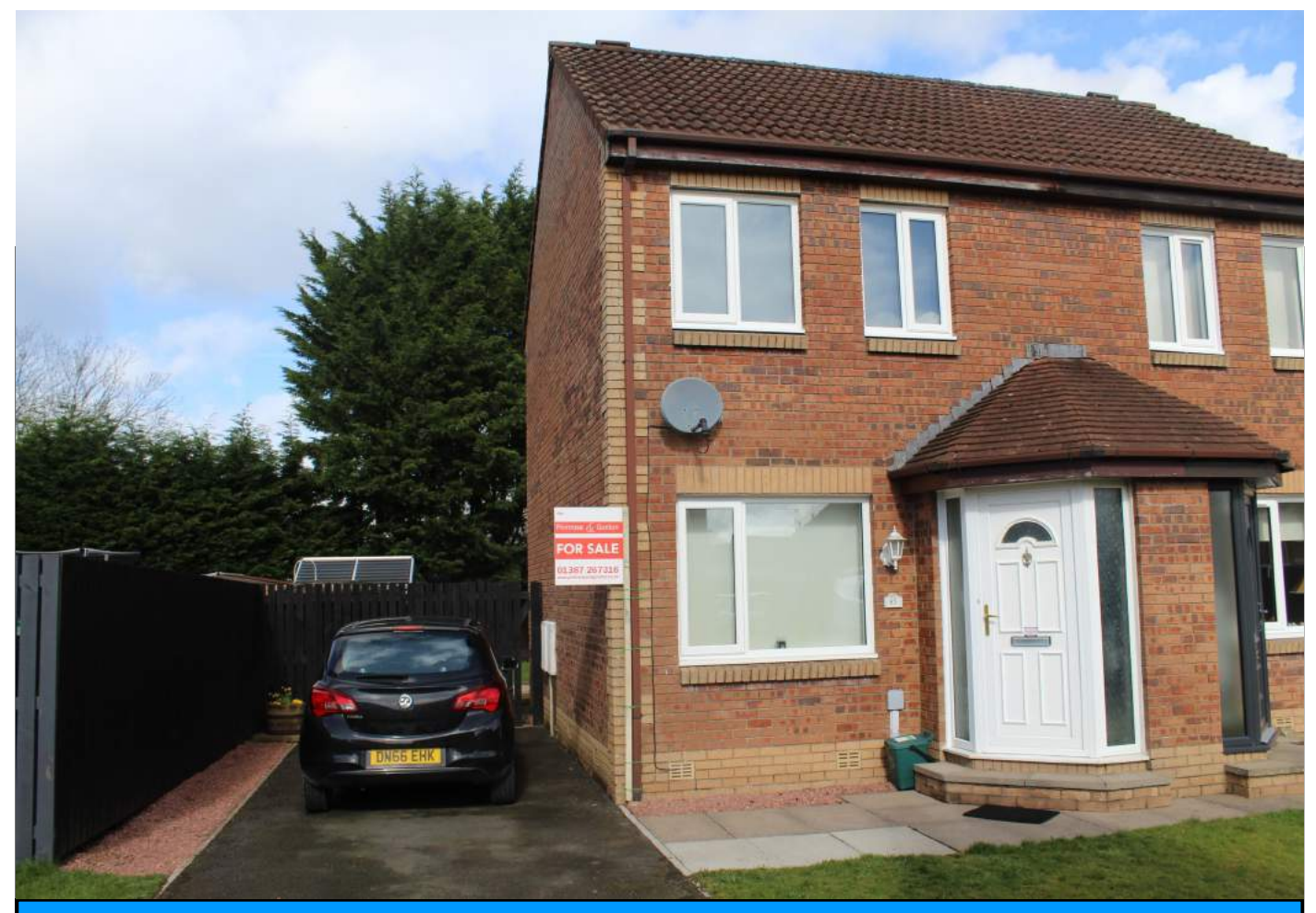
85 WELLINGTON AVENUE, HEATHHALL, DUMFRIES, DG1 3SD