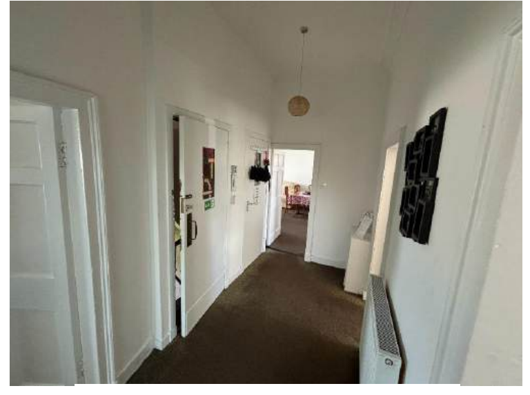
UPSTAIRS FLAT HALL