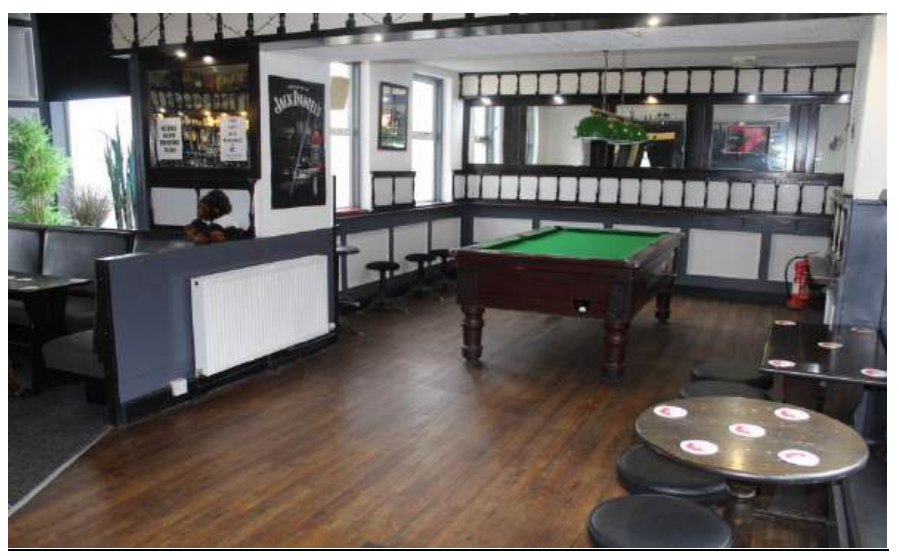
BAR AREA – DANCE FLOOR & POOL TABLE