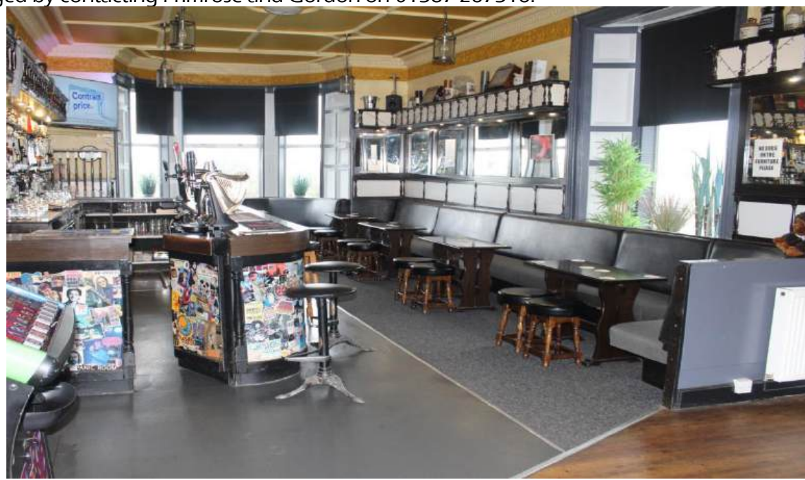
BAR AREA & SEATING

be arranged by contacting Primrose and Gordon on 01387 267316.