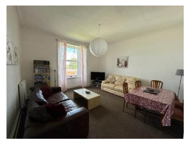
UPSTAIRS FLAT LOUNGE