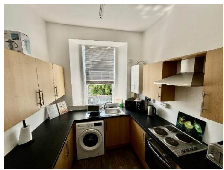
UPSTAIRS FLAT KITCHEN