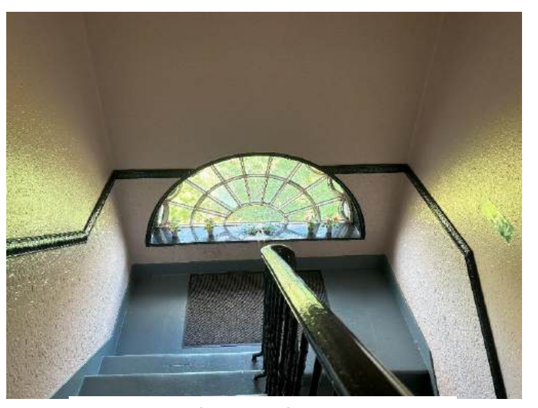
VIEW OF FLAT STAIRWELL