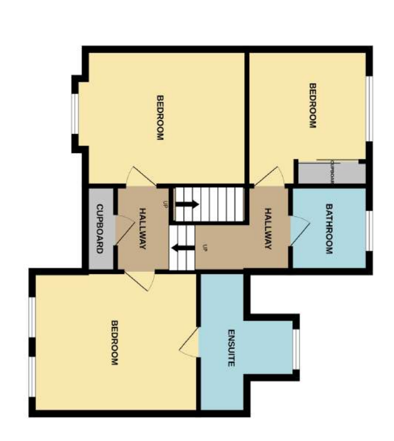
Whilst every attempt has been made to ensure the accuracy of the floorplan contained here, measurements of doors, windows, rooms and any birte items are approximate and no responsibility is taken for any error, omission or mis-statement. This plan is for illustrative purposes only and should be used as such by any prospective purchaser. The services, systems and appliances shown have not been tested and no guarantee Made with Metropix © an be given. Made with Metropix © 2024