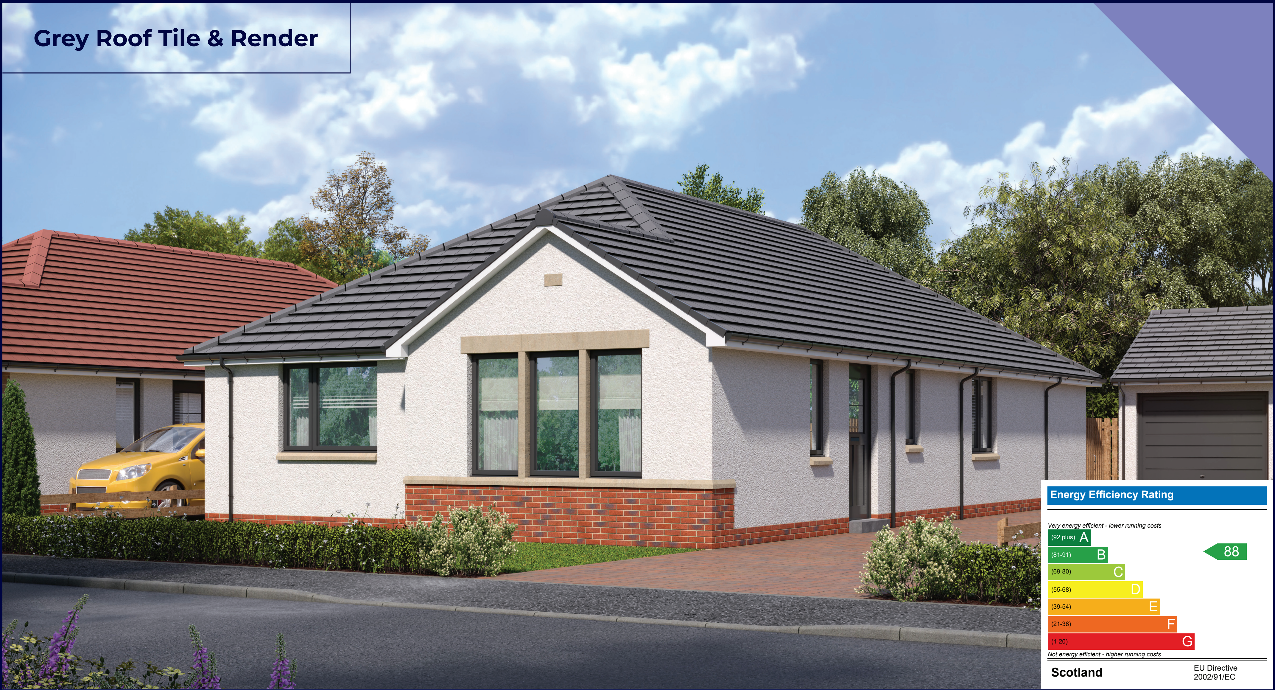
Grey Roof Tile & Render