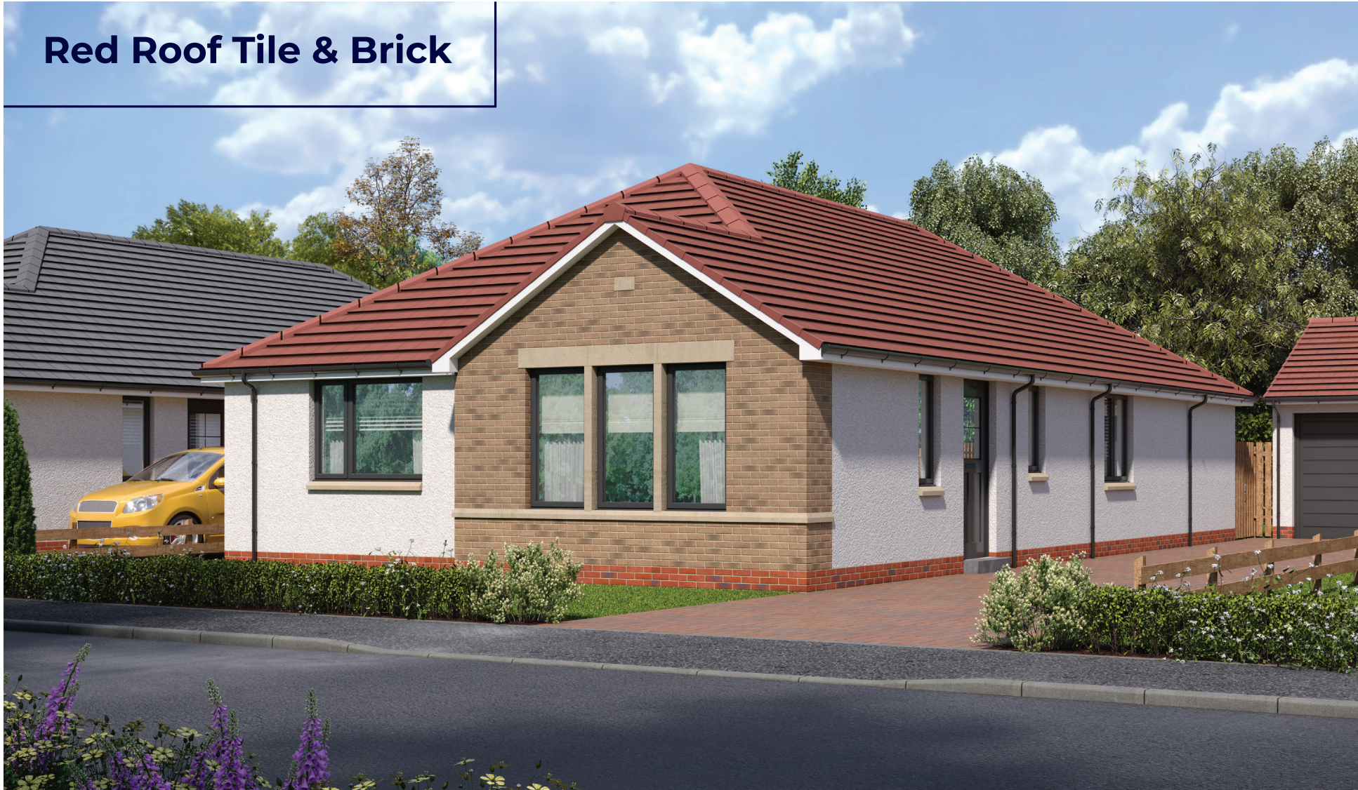
Red Roof Tile & Brick

Three Bedroom Detached Luxury Family Bungalow