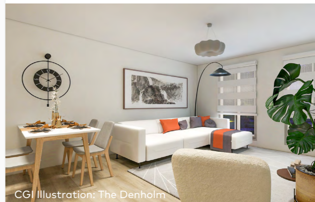
CGI Illustration: The Denholm