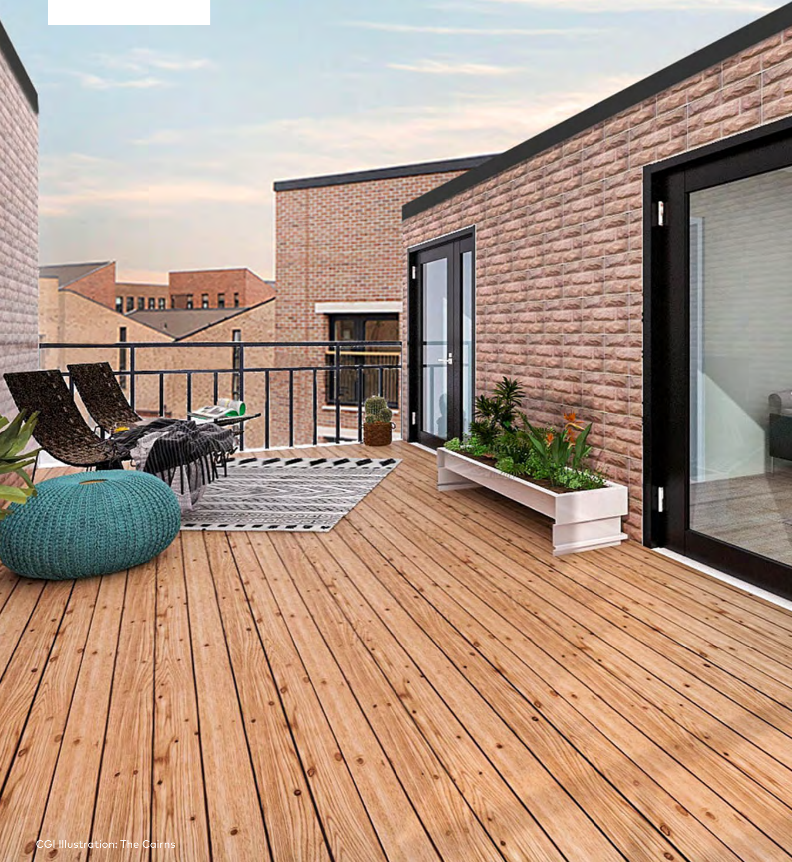
CGI Illustration: The Cairns