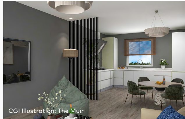
CGI Illustration: The Muir