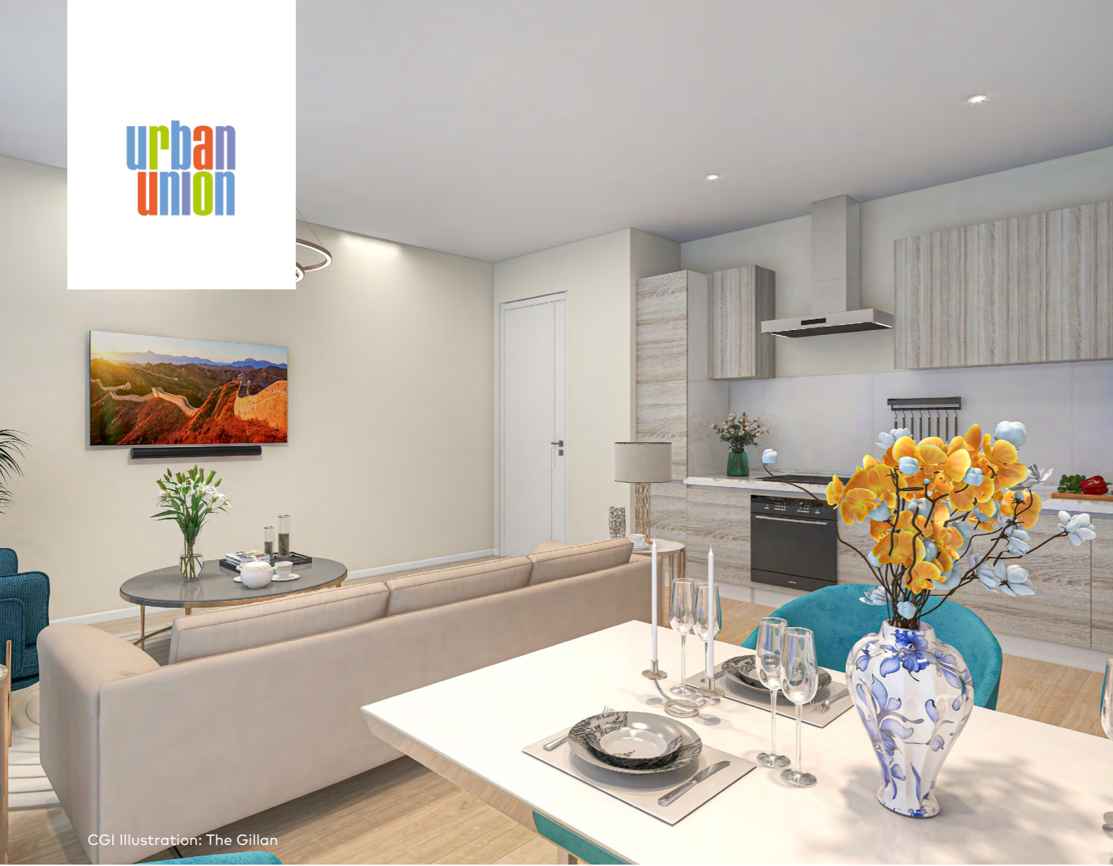
CGI Illustration: The Gillan

FROM OUR COMPACT ONE BEDROOM APARTMENTS TO OUR THREE STOREY TOWNHOUSES, BEAUTY IS IN EVERY SINGLE DETAIL AND LUXURY IN EVERY CAREFULLY CONSIDERED FINISH.