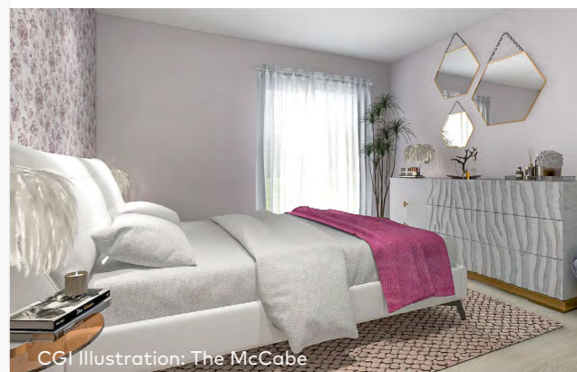
CGI Illustration: The McCabe