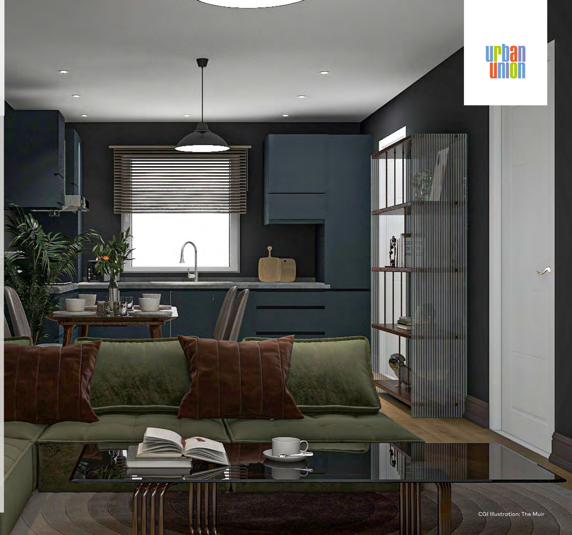
CGI Illustration: The Muir