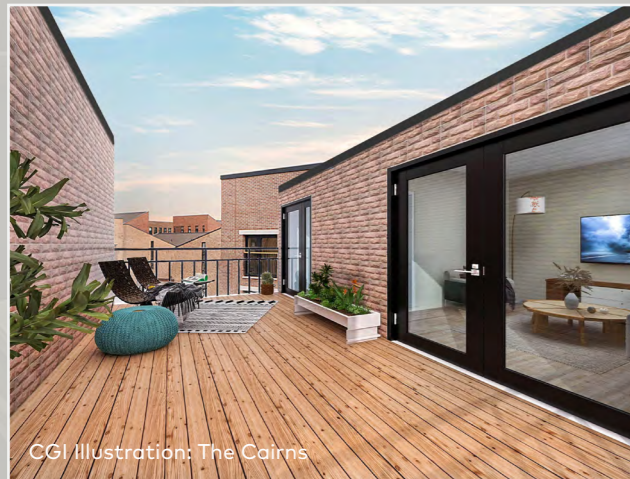
CGI Illustration: The Cairns

Or if you are searching for a more energy efficient low maintenance home, Laurieston Living provides all of this.