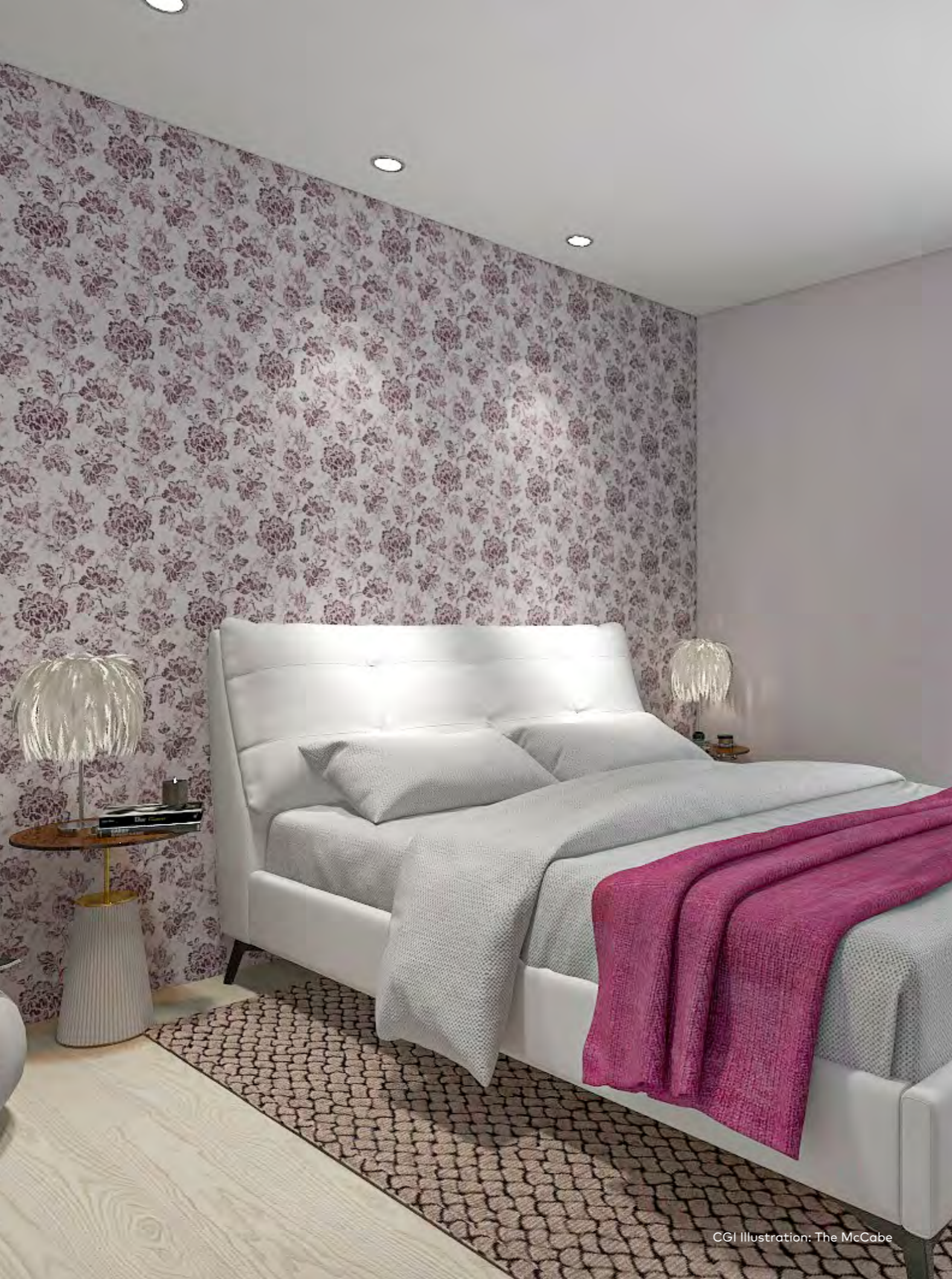
CGI Illustration: The McCabe