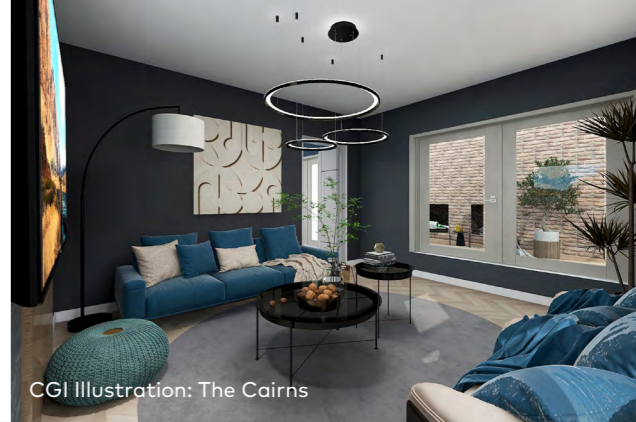
CGI Illustration: The Cairns

Ask about our great range of optional upgrades*. From kitchens and worktops to tiling and flooring, your sales advisor can advise on some great ways to create your own unique space.