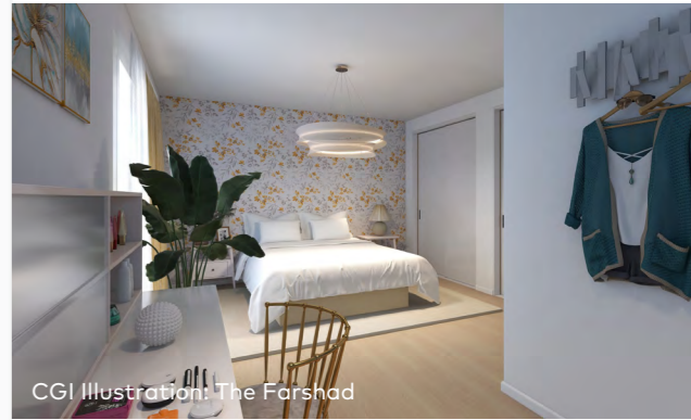
CGI Illustration: The Farshad