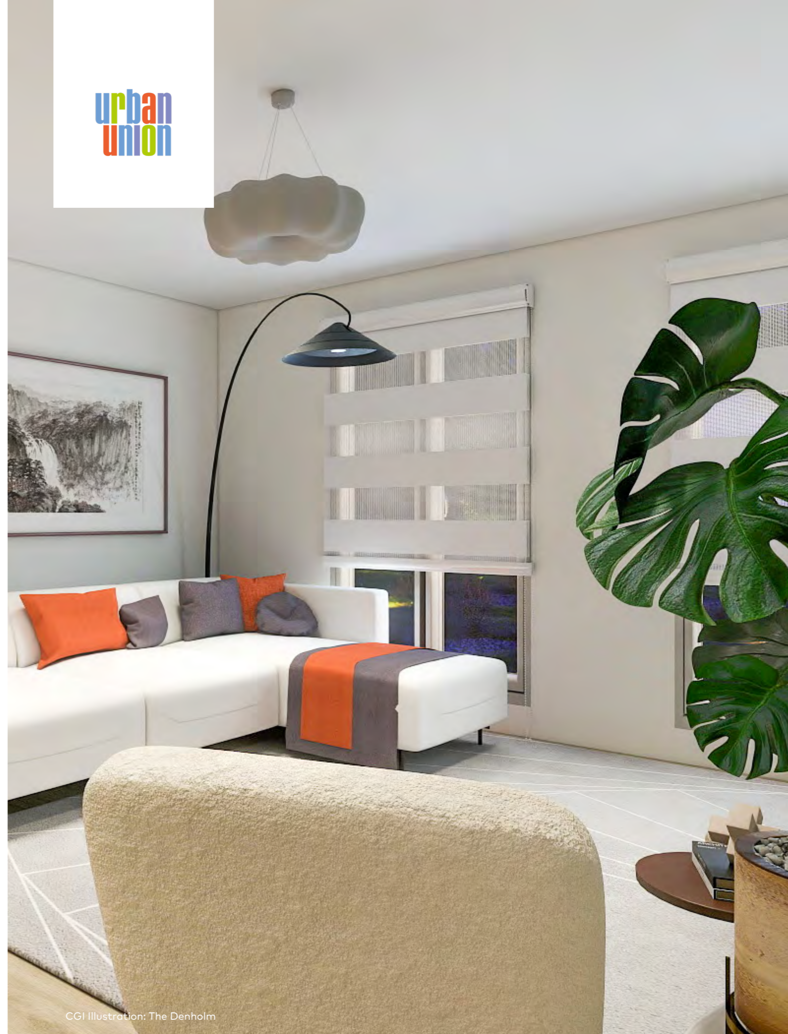
CGI Illustration: The Denholm