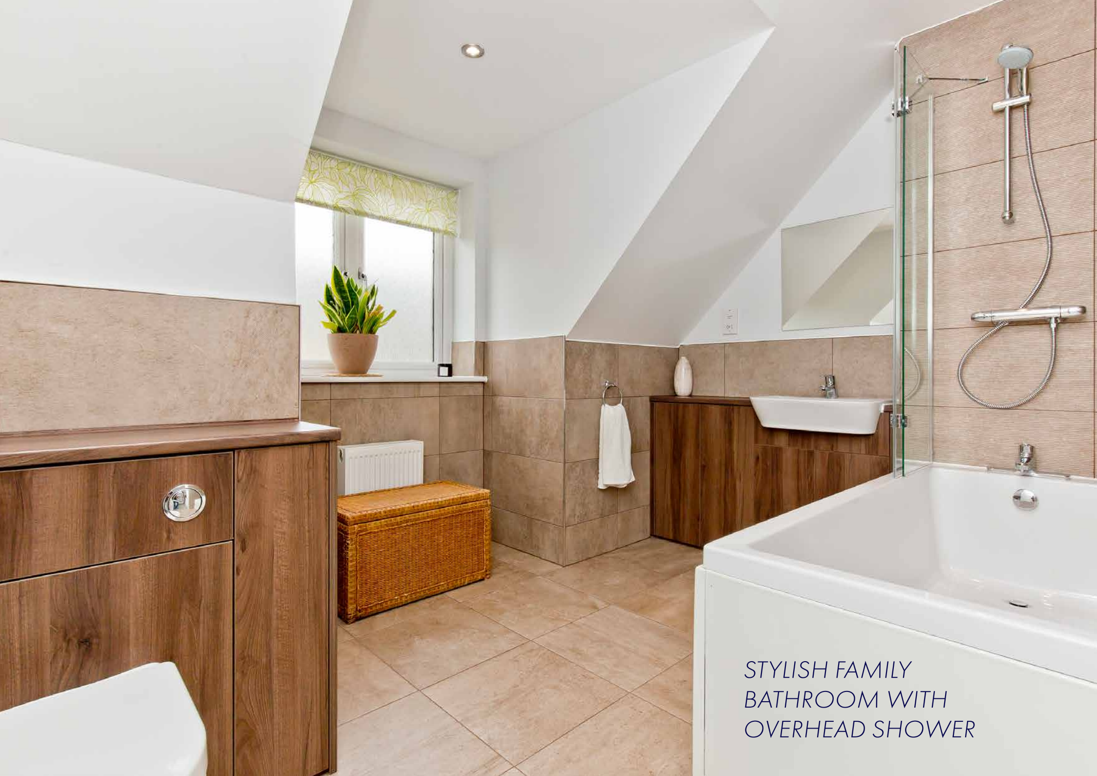
STYLISH FAMILY BATHROOM WITH OVERHEAD SHOWER