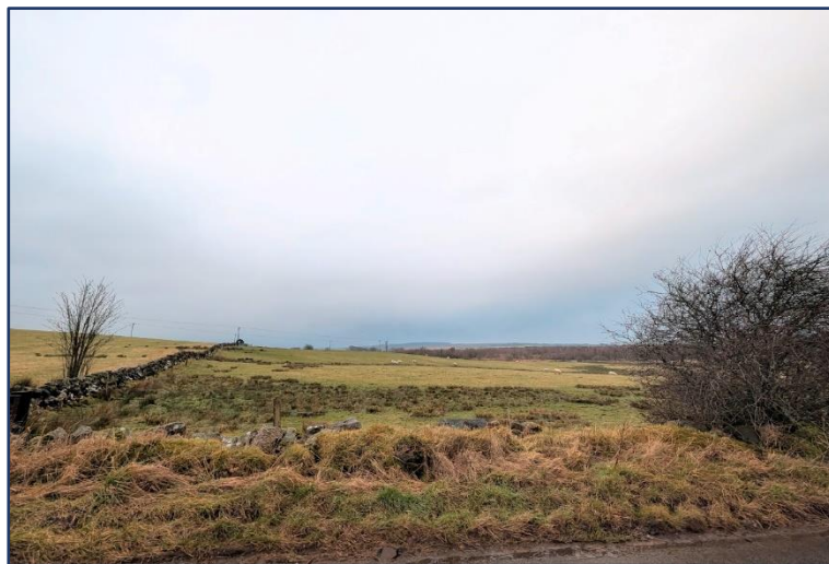
View from property.